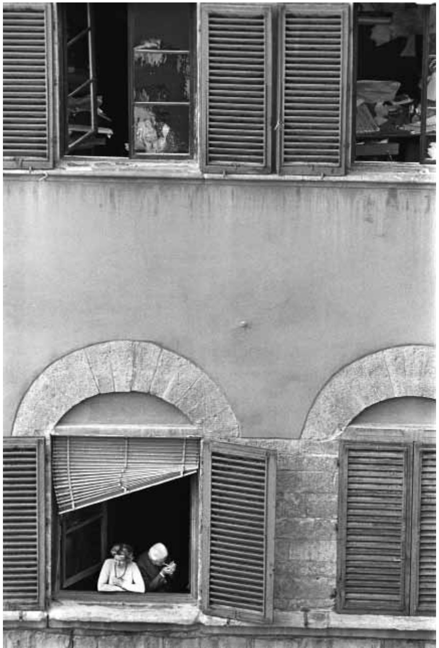
Windows, Florence, Italy

This workshop is for film and digital photographers. Teaching will center on camera and image management so that moments are captured at the time of exposure, not searched for in the editing process.