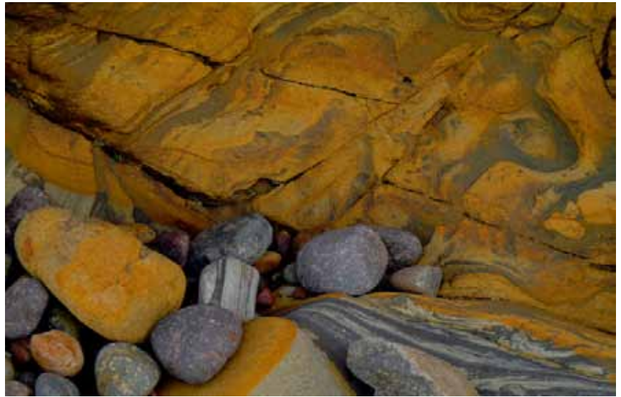
Rock Formation, Weston Beach

This workshop is for film and digital photographers.