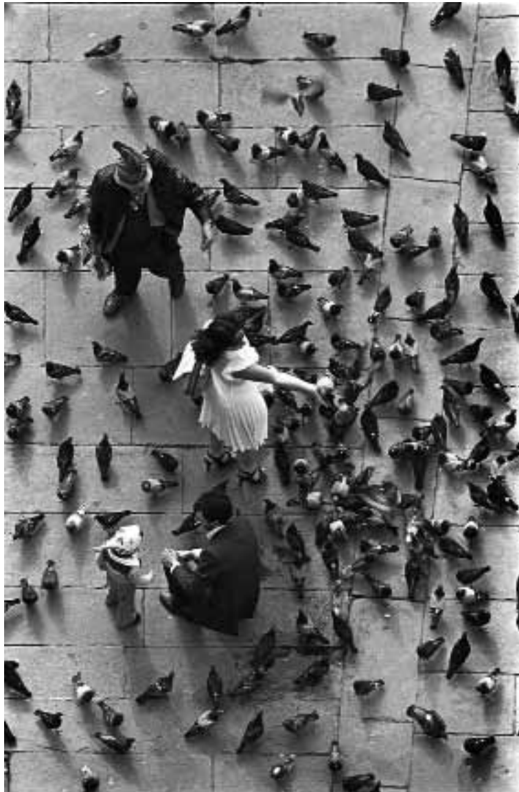
San Marco Piazza, Italy